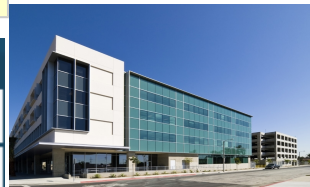
New County Building

LOS ANGELES-Los Angeles County officials plan to debut a new $107-million, 220,000-sf L.A. County Administration Building on Friday on a site formerly occupied by boarded up retail buildings that burned during the city's 1992 riots. The new county office building is a four-story structure that was designed by Gensler Architects and developed for the county by locally based ICO Development LLC in conjunction with the Community Redevelopment Agency of the City of Los Angeles.